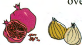
Pomegranates and Figs

The spies went from flat farm land, past a rushing river, past orchards and vineyards clear to the mountains where there were pine and cedar trees. They saw big cities and little farms and different kind of people living there. All the spies agreed that this was a wonderful land. However, some of the cities looked strong and some of the people looked fierce. There were a few who were very tall and strong looking as well as many who were closer in size to the Israelites and friendly looking. After many days the spies came back to report to Moses and the people. When they returned they brought some fruit from the land. They had bags of red, juicy, pomegranates, rich brown figs and a cluster of grapes so big and heavy, that it took two men to carry! The people were amazed and overjoyed when they saw all the wonderful fruit from the promised land.